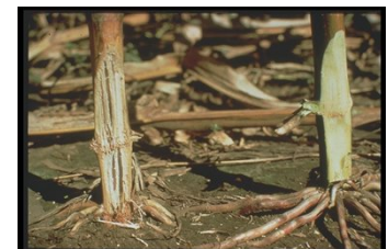
Fusarium Stalk Rot

Fusarium Stalk Rot is one of the most common stalk rots. Its pathogen survives on crop residue and in the soil. Fusarium infects the plant by the pathogen being splashed on the leaf and washing down the leaf into the sheath and infecting at the nodes. It can also infect directly through the roots causing decay in the roots or lower stalk. Wounds from hail or insect feeding can provide additional sites of entry. Fusarium stalk rot along with Gibberella stalk rot produces a reddish-pink discoloration on the internal stalk tissue.