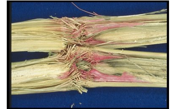
Gibberella Stalk Rot

Gibberella Stalk Rot , which is a pinkish color too, also survives on plant residue or in the soil. Wind blown spores are dispersed to stalks and infect by direct penetration. Infection may also occur through the roots, wounds on the stalk and leaf scars. The spores can also be splash-dispersed and infect the ears and kernels.