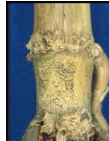
Diplodia Stalk Rot

Diplodia Stalk Rot usually occurs three to six weeks after silking. It is distinguished by internal brown stalk discoloration and dry rot in the lower two internodes of the plant. The pith tissue is usually shredded and black spore forming structures are commonly found on the surface of the lower stalk. Spores can be transferred by wind, rain and insects. As the disease progresses, small brown / black reproductive structures form on the stalk surface near the nodes.