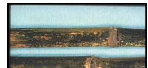
Anthracnose Stalk Rot

Anthracnose Stalk Rot has three components (A) leaf blight (B) stalk rot (C) top die back. Prolonged periods of high temperatures and humidity are conducive to this stalk rot. Top die back occurs mid to late summer and affected fields appear to have a green band across the middle of the plants because the lower leaves are drying up due to normal senescence and the upper leaves are dying from anthracnose. Anthracnose has black discoloration on the inside of the stalk as well as on the surface.